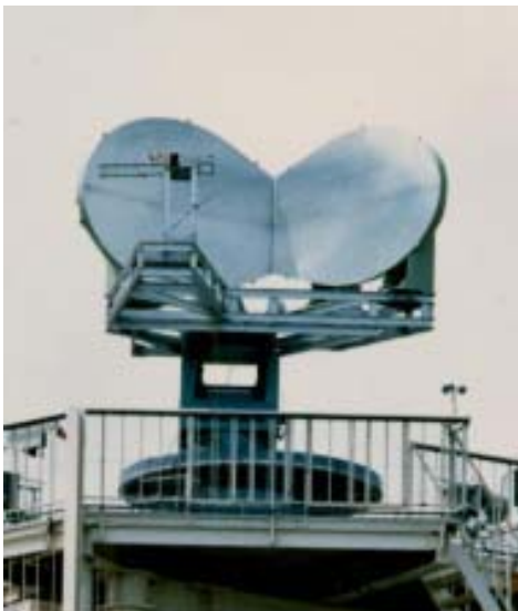
Fig. 8 Front Fed Offset Cassegrain (FFOC) Antenna