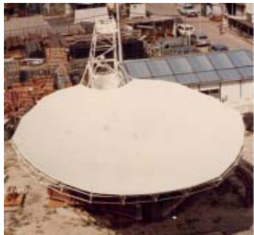
Fig.4 NTT 11.5m Ka-band Offset Cassegrain Antenna