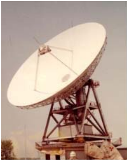
Fig.2 KDD I-3 29.6m Cassegrain Antenna