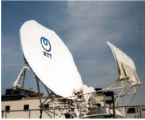
Fig. 6 NTT Ka-band Dual Beam Earth Station Antenna