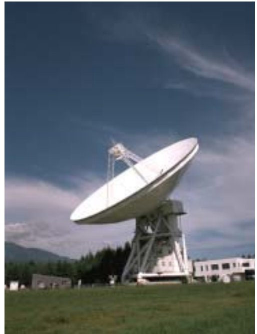
Fig.3 NRO 45m Radio Telescope Antenna