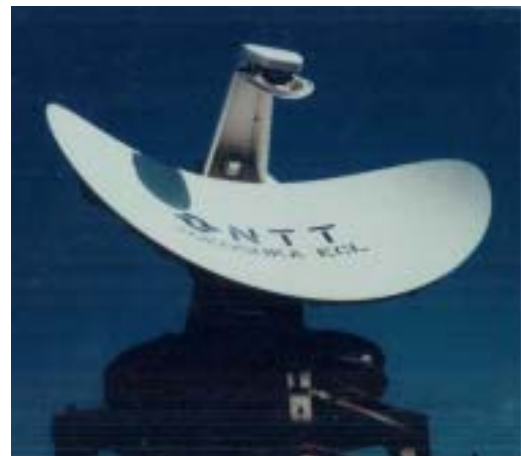
Fig. 5 NTT Ka-band Elliptical Aperture Shaped Offset Cassegrain Antenna