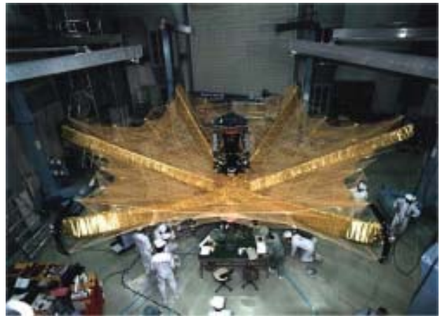
Fig. 10 HALCA (Muses-B) Large Deployable Antenna