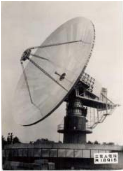
Fig.1 KDD I-1 Cassegrain Antenna