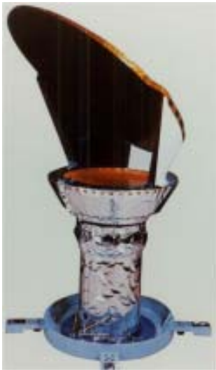
Fig. 7 CS C/Ka-band Shaped Beam Horn Reflector Antenna